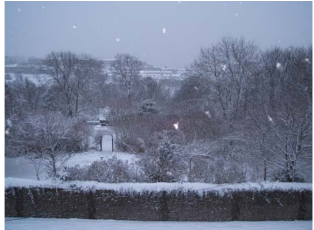
Bear Road, Brighton, Tuesday 2 nd February 2009

Contact Sarita on 01273 819114 or email sarita108@btinternet.com for more details.